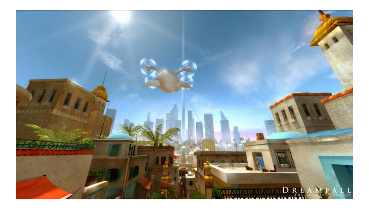
Dreamfall: The Longest Journey License